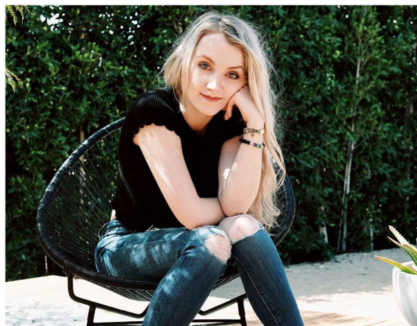
EVANNA LYNCH WILL GIVE A SERIES OF MEDIA INTERVIEWS

By sharing delicious recipes and working with a well-known vegan to bring some magic into the nation's diet for World Vegan Month. Celebrity vegan Evanna Lynch, well-known for her portrayal of Luna Lovegood in the Harry Potter film series, will be supporting World Vegan Month PR by giving a series of media interviews.