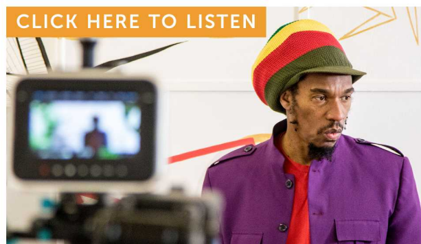
BENJAMIN ZEPHANIAH PENNED A VEGAN ANTHEM

Vegan actor Peter Egan, best known for his roles as Paul Ryman in the sitcom Ever Decreasing Circles and Hugh 'Shrimpie' MacClare, Marquess of Flintshire in Downton Abbey, gave 15 interviews to radio stations on behalf of The Vegan Society. Interviews were secured by a London broadcast agency. Acclaimed poet, musician and Vegan Society Ambassador Benjamin Zephaniah penned a vegan anthem for The Vegan Society to celebrate World Vegan Day and we produced a music video celebrating World Vegan Month that featured Vegan Society supporters.